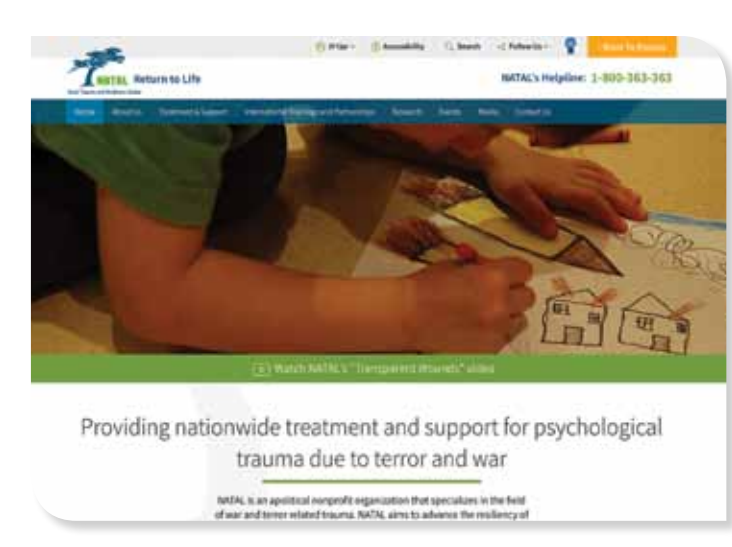
NATAL's new website