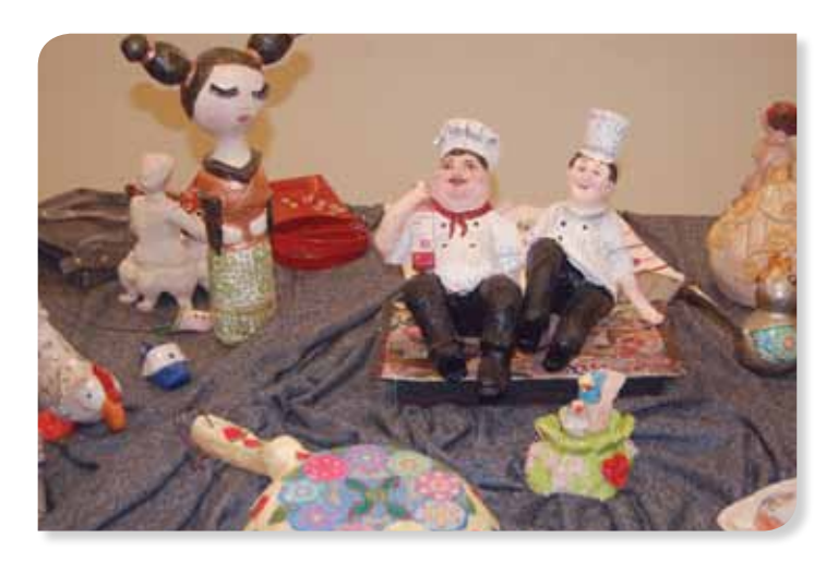
Art work created by club members.

In 2017 we continued to create a safe and supportive environment in the club to make it feel like a second "home" for club participants. By the end of 2017 the Social Therapeutic Club was attended by 43 participants- 22 from the NATAL group, and 21 from the group sponsored by the Ministry of Social Security. As happens each year, effort was put into absorbing new club members from various channels. Club members took part in recreational and rehabilitative activities including the creation of ceramic gifts for donors and visitors. As happens each year, club participants also took part in day trips and social events around holidays. During the year the unit held yom miun